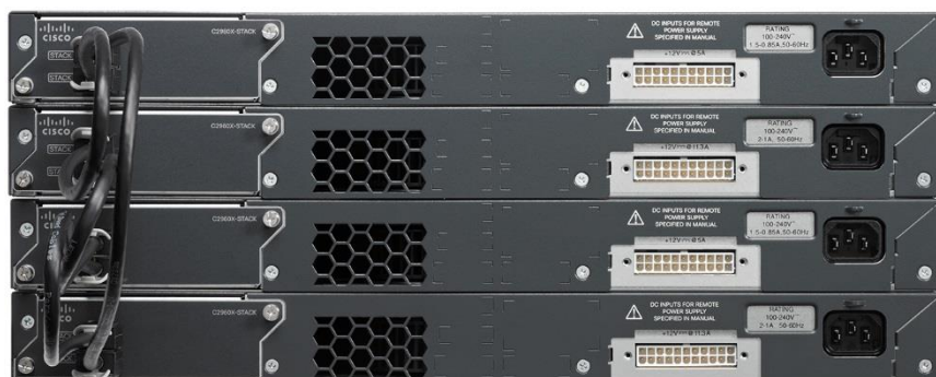
Figure 5. Cisco FlexStack-Plus switch stack